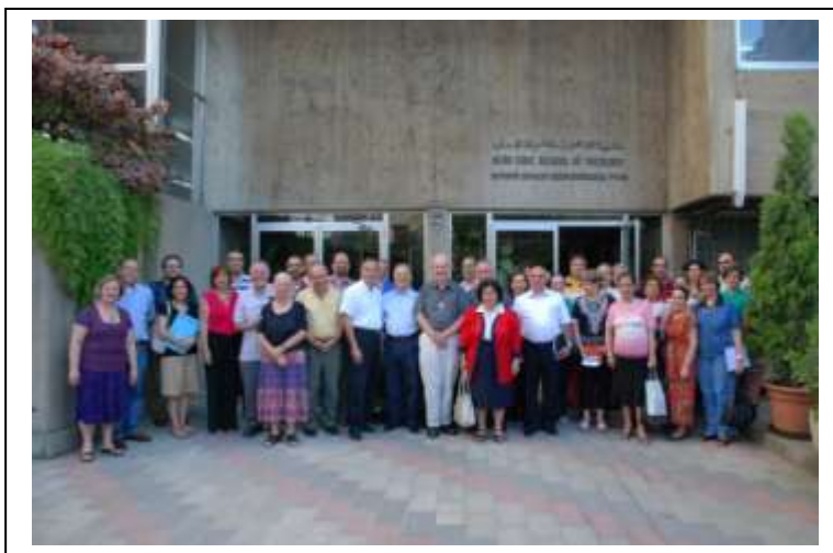
The Continuing Education Seminar Participants including our Iraqi trainees