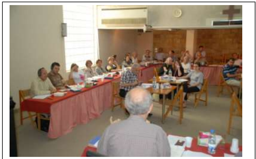
Our Iraqi Participants at The Continuing Education Seminar